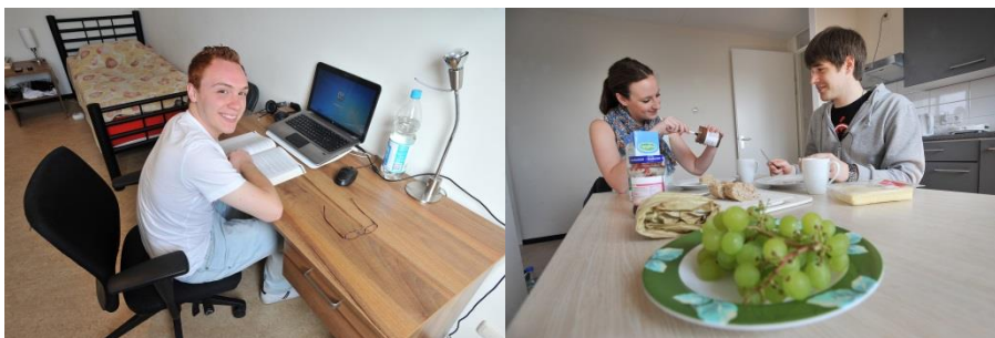
One of the dormitories